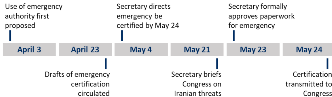
Figure 2: Timeline of Events Related to the May 2019 Emergency Certification