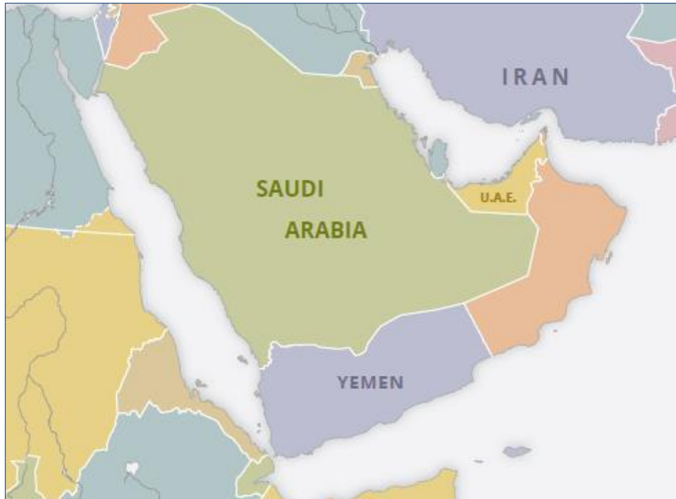
Figure 1: Map of Yemen and Gulf Region

OIG modified the map to label select countries referenced in this report.